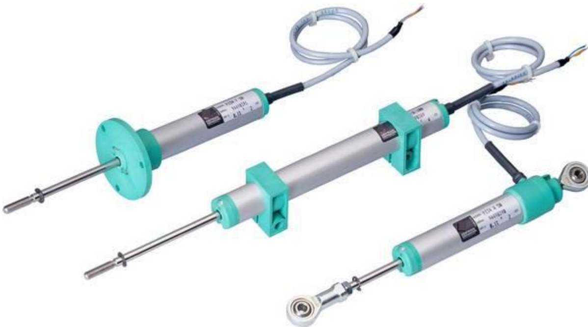
Figure 1 - Linear Position Sensor

The Sensor being used in this application is a linear position sensor as shown in Figure 1. The sensor is provided with power and ground and outputs a voltage that represents the position of the sensor. Internal to the sensor is a linear potentiometer where the wiper moves in response to the extension of the sensor arm. The voltage present on the wiper will be measured using one of the ORB's voltage inputs.